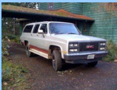
Please Help Fix the Suburban!!

Speaking of DelCarpine . . . our poor old Suburban has blown its transmission and we are praying for a miracle. It will cost $2200 to bring it back to life. We really need the truck to haul the guys and our trailer full of tools to job sites. If you have ever thought about supporting WINGS we could really use your support to get